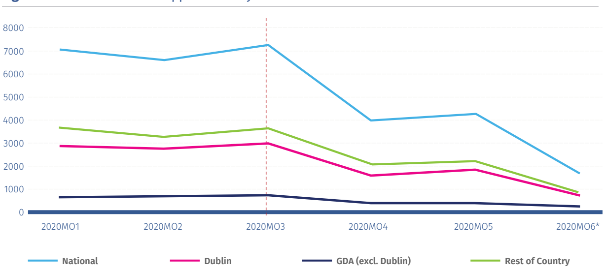
Figure 2 - New and renewal applications by month

Figure 2 shows that between March and April there was a significant decline in the number of tenancies registered with the RTB. While in March there were over 7,000 registrations, in April this had fallen to less than 4,000. The number of new registrations also remained subdued in May. As the June data only contains applications for half the month, these figures should not be compared with the prior months.